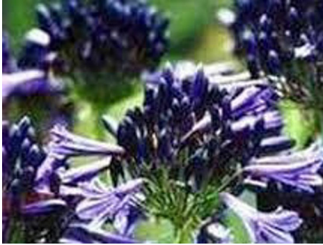
Agapanthus hybrida Black Pantha

Botanical Name: Agapanthus hybrida Black Pantha Common Names: Lily of the Nile, African Lily, Native: No Foliage Type: Evergreen Plant Type: Grasses, Strappy & Tufting, Hedging / Screening Plant Habit: Clumping