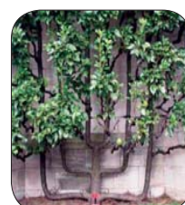
Espalier - Fruit Tree