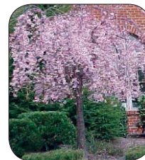
Prunus x subhirtella 'Pendula Rubra'