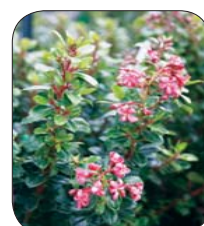
Escallonia 'Pink Pixie'