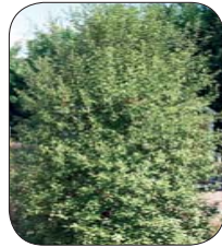
Pittosporum 'Screen Master'