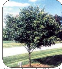
Malus ioensis 'Plena'