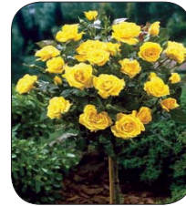
Rose - Standard