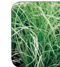
Carex 'Frosted Curls'