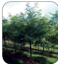
Gleditsia triacanthos 'Shademaster'