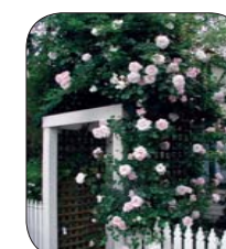
Rose - Climbing